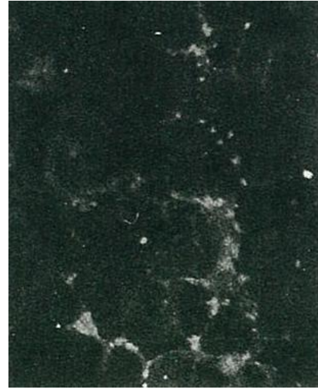
Fig.2 Detection of HCV NS5b protein by immunofluorescence antibody staining. Chimpanzee liver cells were infected with recombinant vaccinia virus containing a HCV genome cDNA. After incubation for 48 hr, the cells were fixed with acetone and HCV NS5b protein was detected by indirect immunofluorescence staining using this antibody.